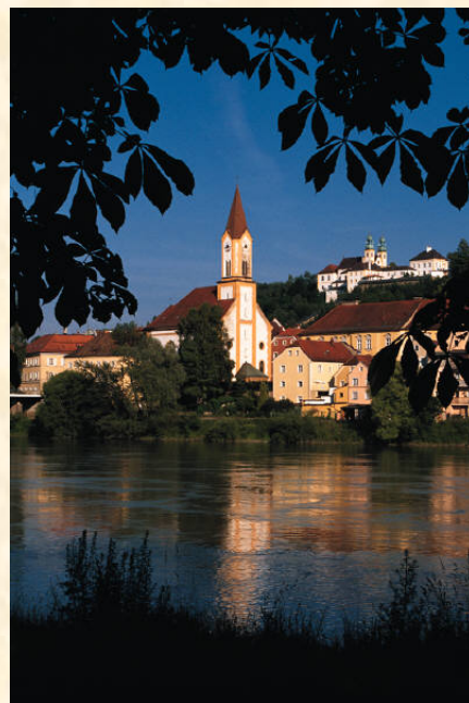
Castle on the Danube

From 2001 we offer reduced prices for pensioners and students in order that Hungarian tourists should find our services more attractive.